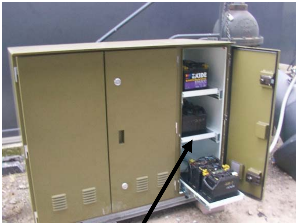
Optional Battery Power on "Roll-out" Draws, provides 7-8 days of continuous power.