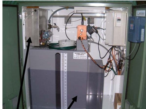
200 Ltr Chemical Tank & Bund. Stainless Steel Sample Waste Return System

The procedures applied at most of the 30+ sites, now in operation in several major Victorian Water Authority Regions, follow a process developed by C-Tech Services Pty Ltd. The following schematic, (Fig. 1), portrays the basic process, however, as one might anticipate, there are variations to suit local site conditions.